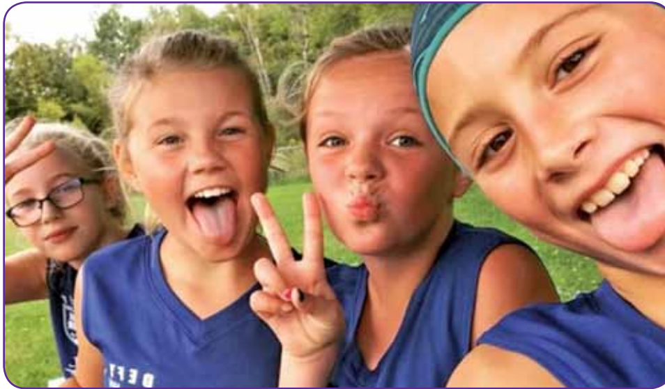
Some of our Travel Soccer girls getting pumped for their next game!